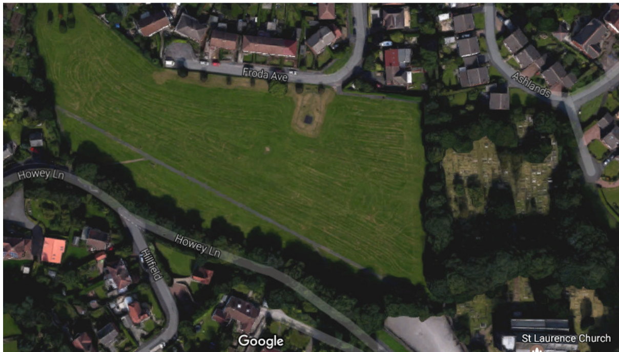
Diagram of the area

During the New Year's Eve fireworks display at Frodsham Church Fields a number of firework shots exploding at low level and in close proximity to the viewing crowd. There have been reports of fireworks firing horizontally and exploding outside of the fallout zones.