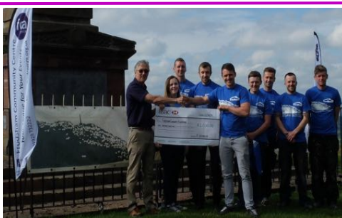
Woodhouse Plumbing, Heating and Electrical Ltd. sponsors of the 12th Frodsham Downhill Run.

Private, individual or group donations can be made online at centre.frodcomm.org.uk or just put a cheque in the post!