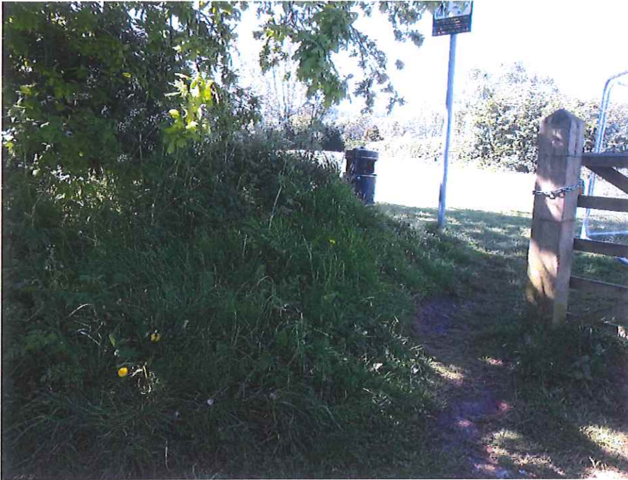
TOWNFIELD LANE MAIN GATE

Proposed area that could be improved to increase disabled access.