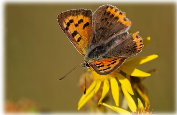
Small copper butterfly