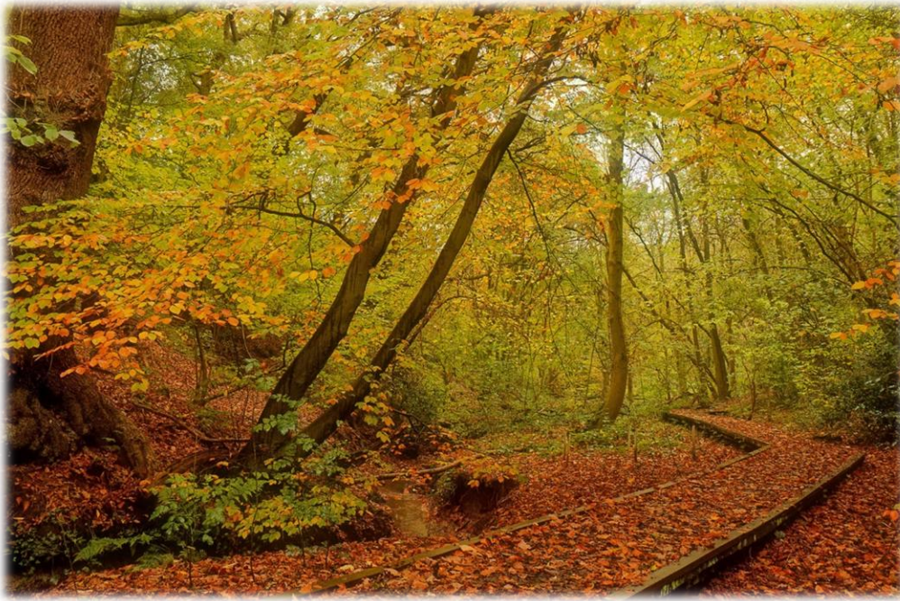
Autumn in Hob Hey