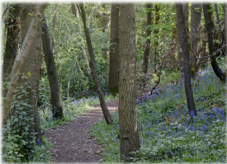
Bluebells in spring

This is 'the tip of the iceberg' as many species are difficult to identify, but it does show just how biodiverse the wood is, given its size. Further efforts will continue in 2023.